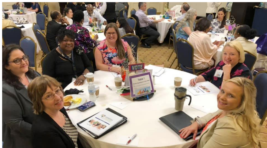
Sharing Symposium participants get ready to discuss ways to implement DCCI Task Forces in Florida's communities